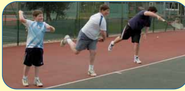
Tennis for all, from 5 to 18 years old